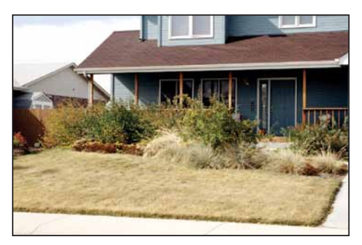
A yard under xeriscape can be maintained with less water and fertilizer in many situations. (Design/photo by Grant Reid.)

Alternatives to Kentucky blue grass, such as buffalograss, blue grama grass, and turf-type fescue can provide a beautiful lawn that requires fewer resources. However, be aware that each alternative grass has its own advantages, disadvantages and maintenance needs. Often, homeowners plant grass in areas that are too shady, or that have steep slopes or poor soils where lawn grass just doesn't grow well. More fertilizer and water are not the answers in these cases. It's usually best to replace this grass with hardy ground covers, ornamental bunch grasses or mulch.