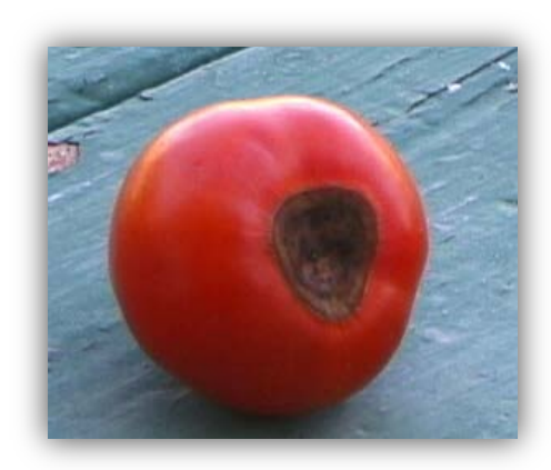
Figure 9. Blossom end rot on tomato is caused by water imbalance between the fruit and soil. The soil could be too wet, too dry, or root could be cut by cultivation. It could be aggravated by soil compaction and poor soil preparation.