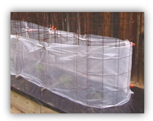
Figure 5. Wrapping the tomato cage with plastic or newspapers protects tender plants from cold winds.

<u>Single pole trellis</u> – Some gardeners prefer to trellis tomatoes on a single pole or stake. To do this, prune plants to a single trunk by removing all side shoots. This requires constant removal of side shoots.