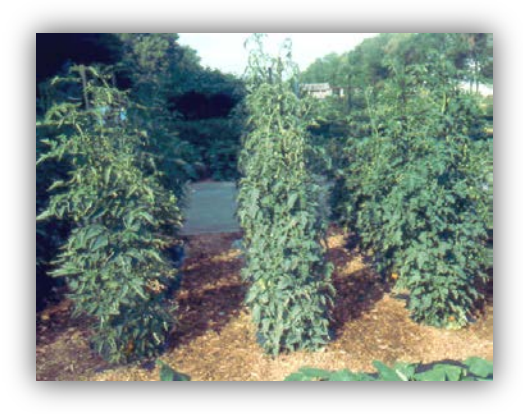
Figure 6. Tomatoes trellised to a single pole.

<u>Fan trellis</u> – Another method, which produces larger fruit, is to trellis to a three-trunk, fan shape, removing all other side shoots. This requires a sturdy frame to support the weight of the vine and fruit.