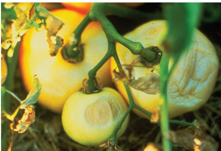
Figure 12: Sunscald on tomato fruit.

or INSV) (Figure 9) has traditionally been a problem in commercial tomato production. Recently, however, the disease has increasingly been found in home gardens. Symptoms begin as dark brown to purple spots on leaves. The dark areas