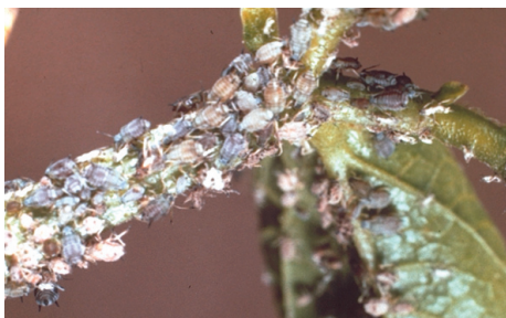
Figure 6: Aphids.

applications of insecticidal soap are quite effective.