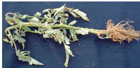
Figure 1: Phosphorus deficiency.

Psyllids (Figure 2) are more commonly found in eastern Colorado and are seldom a problem in western Colorado. They feed on tomato or potato plant sap and inject a toxic saliva that causes the characteristic "psyllid yellows." Leaves turn yellow; veins often turn purple. Stems may become distorted, giving the bush a zig-zag appearance. To confirm psyllids, check the undersides of leaves for nymphs. Nymphs are about the size of an aphid. At first, they are yellow, then they turn green. They are sedentary while feeding and secrete small, white granules that resemble sugar. For best control, dust the foliage, especially the undersides, with sulfur. See fact sheet 5.540, Potato and Tomato Psyllids .