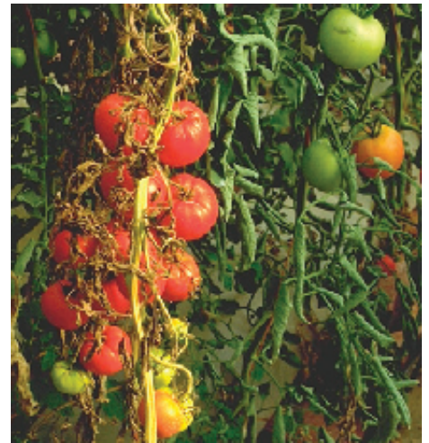
Figure 7: Fusarium wilt.

Bacterial canker (Figure 8) occurs sporadically in Colorado. Symptoms begin with lower leaves turning downward. Dark to light brown streaks may develop on the leaf midribs and eventually extend down the petiole to form a canker on the