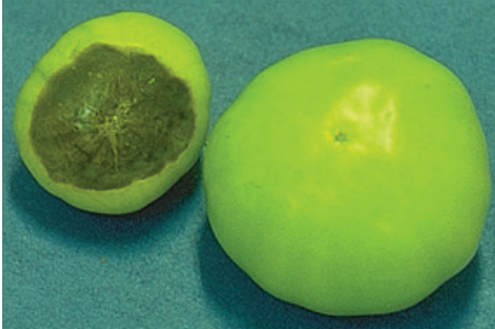
Figure 11: Blossom end rot.