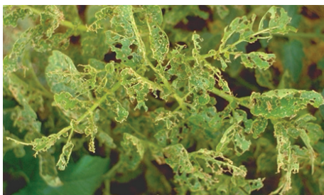
Figure 3: Evidence of flea beetles.

Flea beetles (Figure 3) are small, black or brown beetles that jump when disturbed. The adults chew small holes or