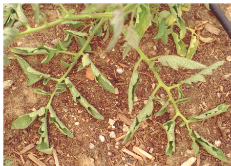
Figure 2: Psyllid damage.