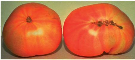
Figure 10: Catfacing.