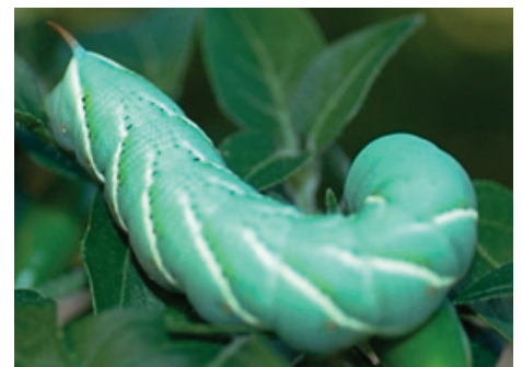
Figure 4: Tomato hornworm.

Tomato or tobacco hornworms (Figure 4) are large, green or gray-green caterpillars with white to tan v-shaped or dashed markings on their sides. A green to reddish horn protrudes from the hind end. They are voracious feeders, stripping leaves from stems and even eating unripe fruit. Pick them off by hand. The caterpillars