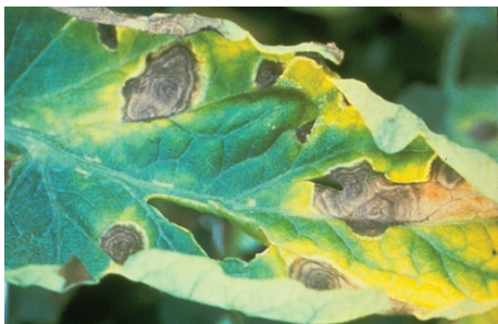
Figure 5: Symptoms of early blight.

Whiteflies and aphids (Figure 6) both cause leaf yellowing and leave a characteristic sticky excrement called honeydew. Leaves appear shiny and are somewhat sticky when honeydew is present. Damage usually is minimal on tomatoes and often can be ignored. If aphids become a problem, some