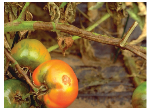
Figure 8: Bacterial canker.